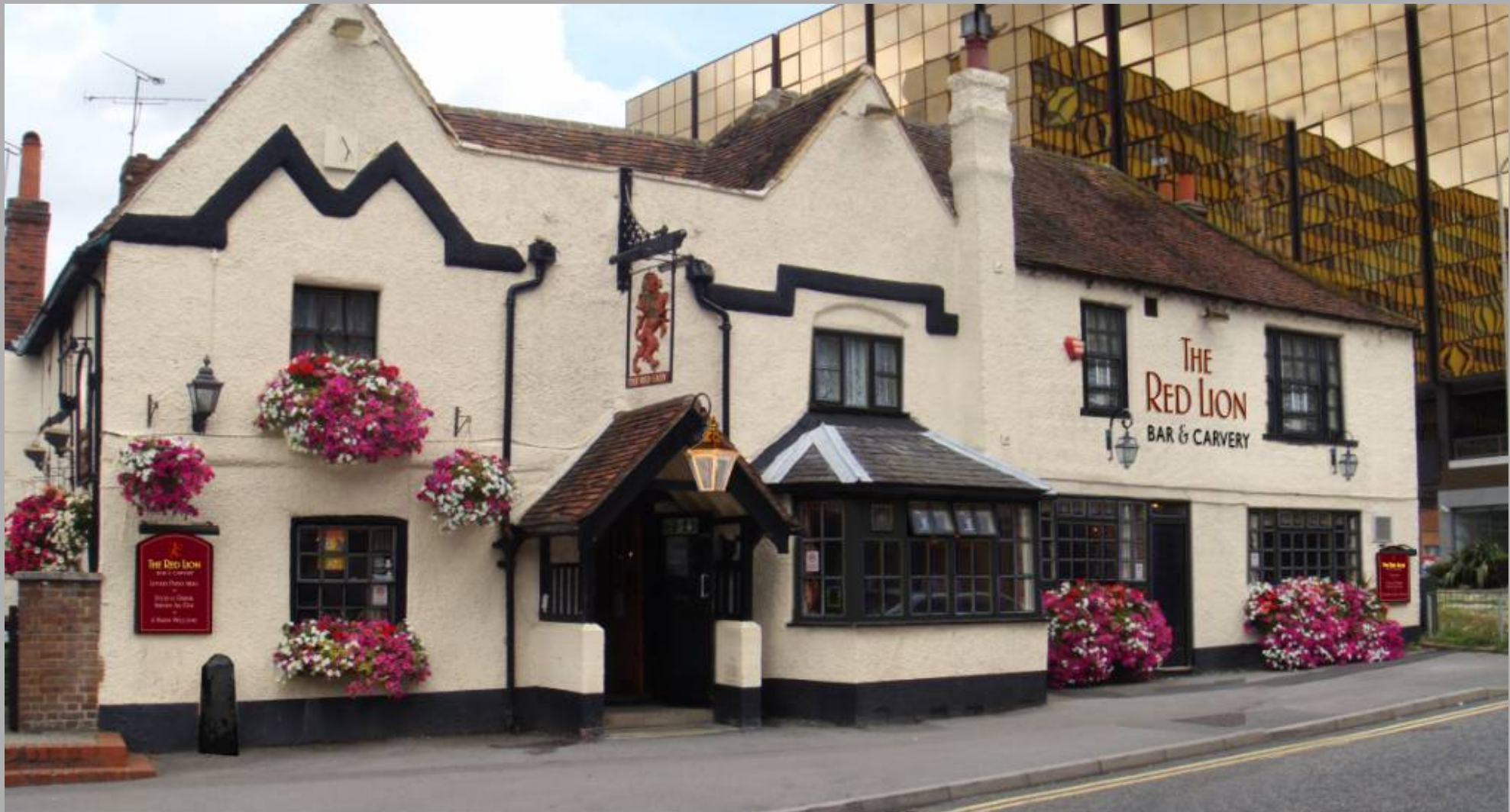
Red Lion, Bracknell High Street, Bracknell, Berkshire, RG12 1DS